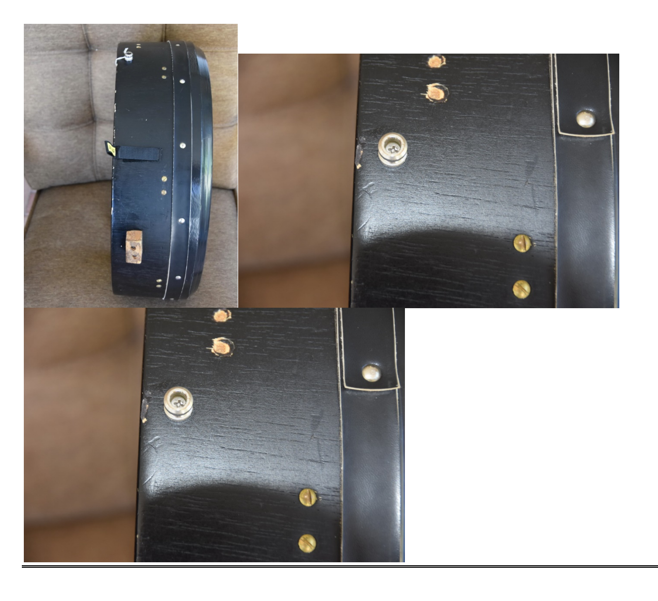
<u>Vignole 16" x 5.5" Bodhran - skin head - $300</u> 16" x 5.5" - skin head - NO case, good drum with single crossbar-skin head, tuners and tuning wrench - by Michael Vignole